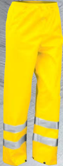
FLUORESCENT YELLOW (394)

GENEROUS SIZE ALLOWING TO BE WORN AS AN OVER GARMENT