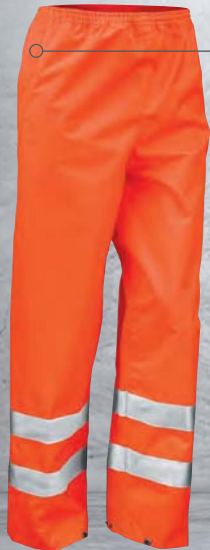
FLUORESCENT ORANGE (811)

Elasticated waist with drawcord adjuster