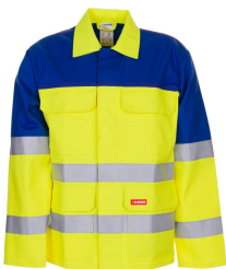
yellow/royal blue 5202